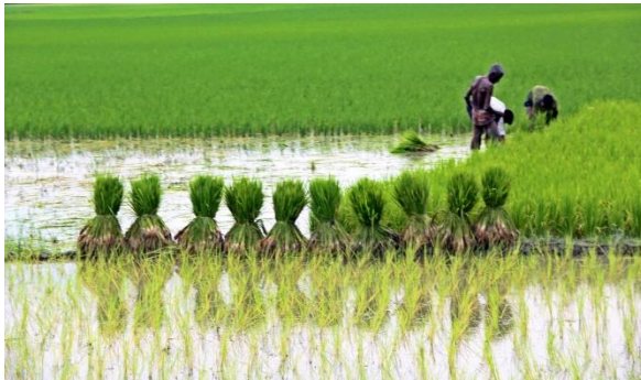
Agriculture of Bangladesh